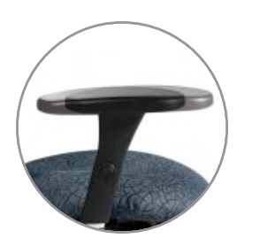
Armcap slides forwards and back

Other optional arms available including the Special Low Rise arm (6L), which is height adjustable (6.6" to 9") and width adjustable (WA).